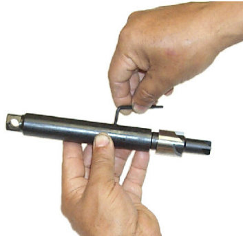
This counterbore removes a step in the aluminum head found in the 1L2E Ford heads.

Using the wrench provided in the p/n 5553 kit, counterbore the hole to the full depth permitted by the tool P/n 55518 until the counterbore bottoms out on the hole and spins freely.