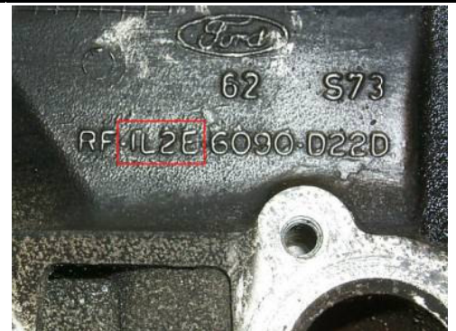
Casting number above 1L2E.